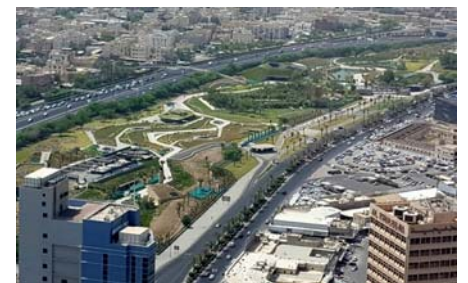
This aerial photograph shows the Al Shaheed Park, which is meant to provide a cross-over from the old city of Kuwait to the modern business centre of Kuwait City.