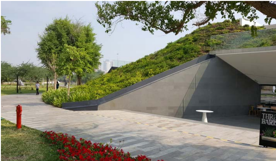
Various events take place inside the mound shaped visitor's centre.