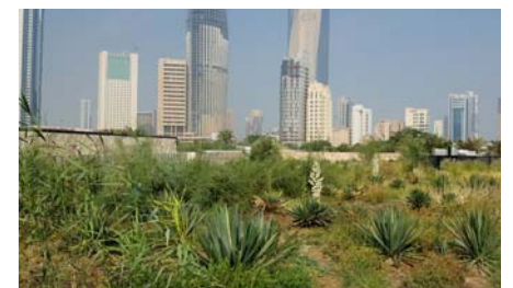
A green roof as part of the "Habitats Museum" where the focus is set clearly on Kuwait's nature.