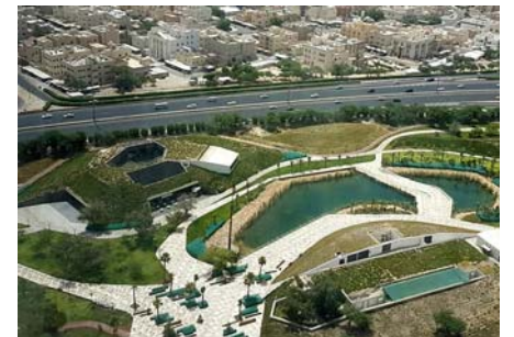
The visitor centre is visible in the upper left corner and the administration building in the lower right one; An artificial lake is situated in between.